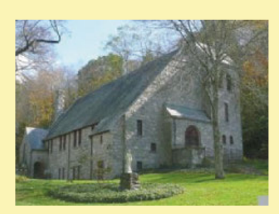
OUR LADY OF PERPETUAL HELP

34 Green Hill Road - P.O. Box 303 Washington Depot, CT 06794